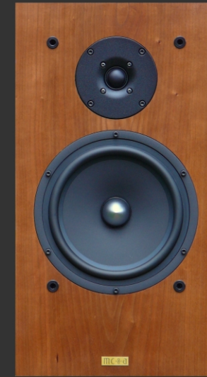
Model CV-2 with cherry crown veneer